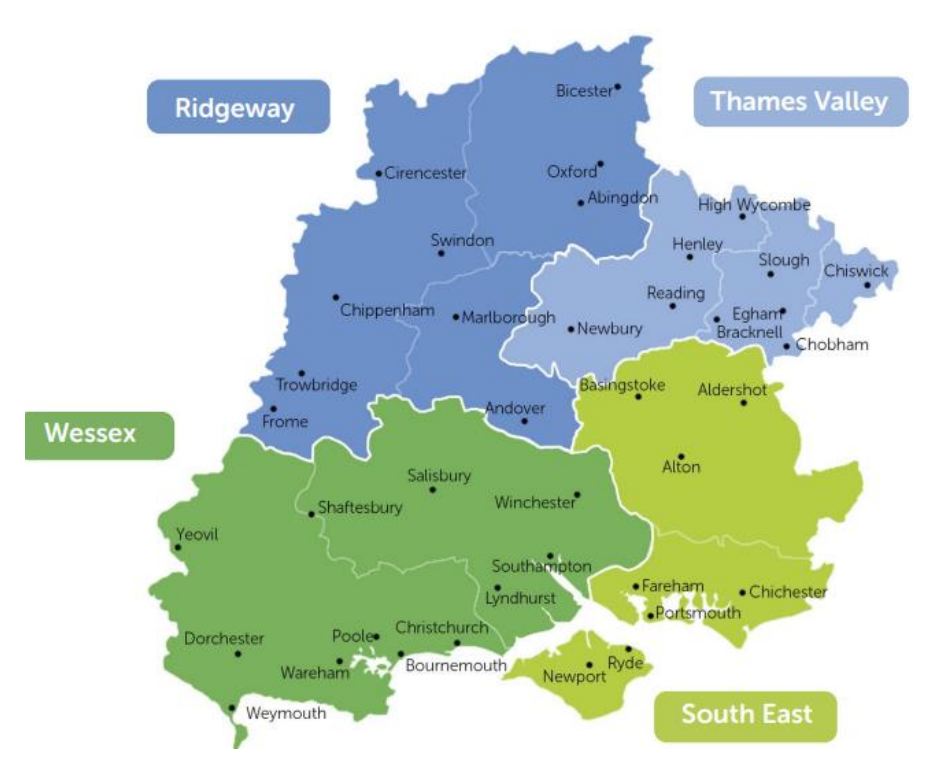
Figure 1 - SEPD region

The capacity provided by the existing four SGTs is fully allocated to SEPD as firm connections as defined within the Security and Quality of Supply Standard (SQSS).